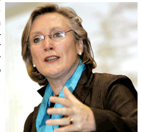
The Honourable Carolyn Bennett